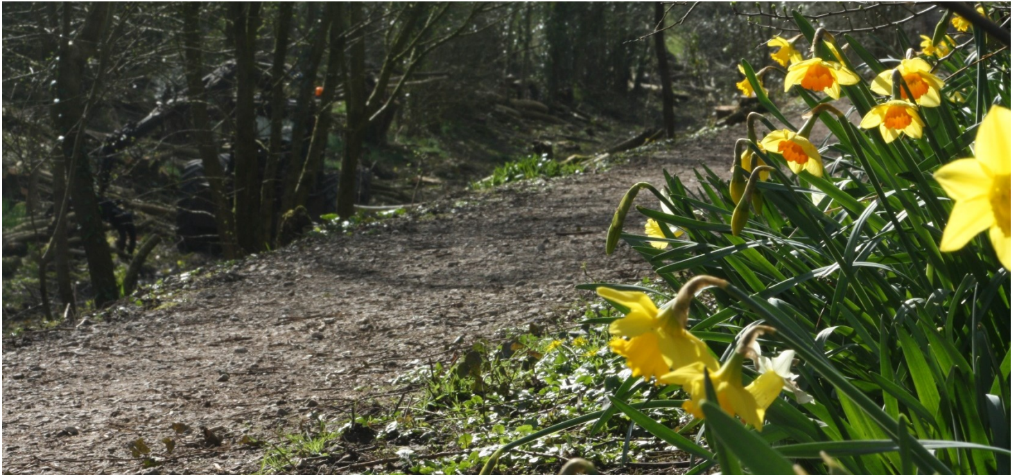
Signs of Spring - at last. Daffodils along the towpath